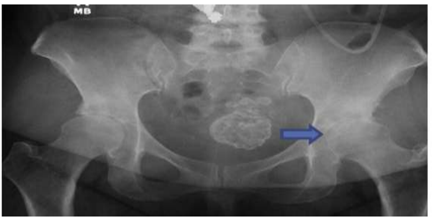
Fig 3.1: Severe left narrowing of the hip joint space (arrow).

The knee joint is typically evaluated using the extended-knee radiograph, which is a bilateral antero posterior image acquired while the patient is weight-bearing, with both knees in fullextension [17].