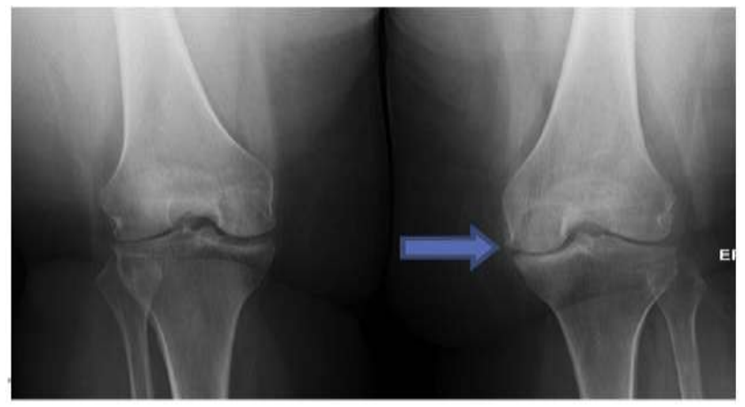
Fig 3.2: Severe narrowing of the medial compartment (arrow).